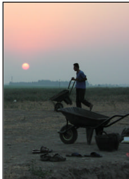
Dawn at the dig, 5:30 am

Because the Tell Kurdu project is still a young one, we have not established our own 'dig-house' yet. Luckily, the president of Mustafa Kemal University in Antakya allowed us to live in the guest house of his university and use part of the sports arena as our field lab. With the exception of Saturday (our holiday), our days began at 4:00 am when we woke up in the dark and stumbled to the lab where we had a small breakfast of coffee and cookies. Getting up at this hour was necessary to be at the site by dawn, as we had a 45 minute drive to the site.