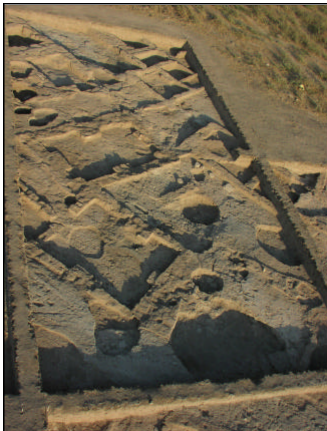
Aerial shot of houses and streets at Tell Kurdu

Excavation involves exposing ancient buildings and artifacts, but it also means removing those finds from their original context. It is therefore of crucial importance to record in as much detail as possible where finds come from and which artifacts were found together. It is this 'contextual' information that allows archaeologists to discover the stories behind the artifacts they excavate. The high standards of