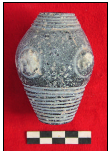
Kurdu Newsletter Incised stone mace head (right) and three painted ceramic vessels recovered from the excavation of a burial (above) PAGE 4